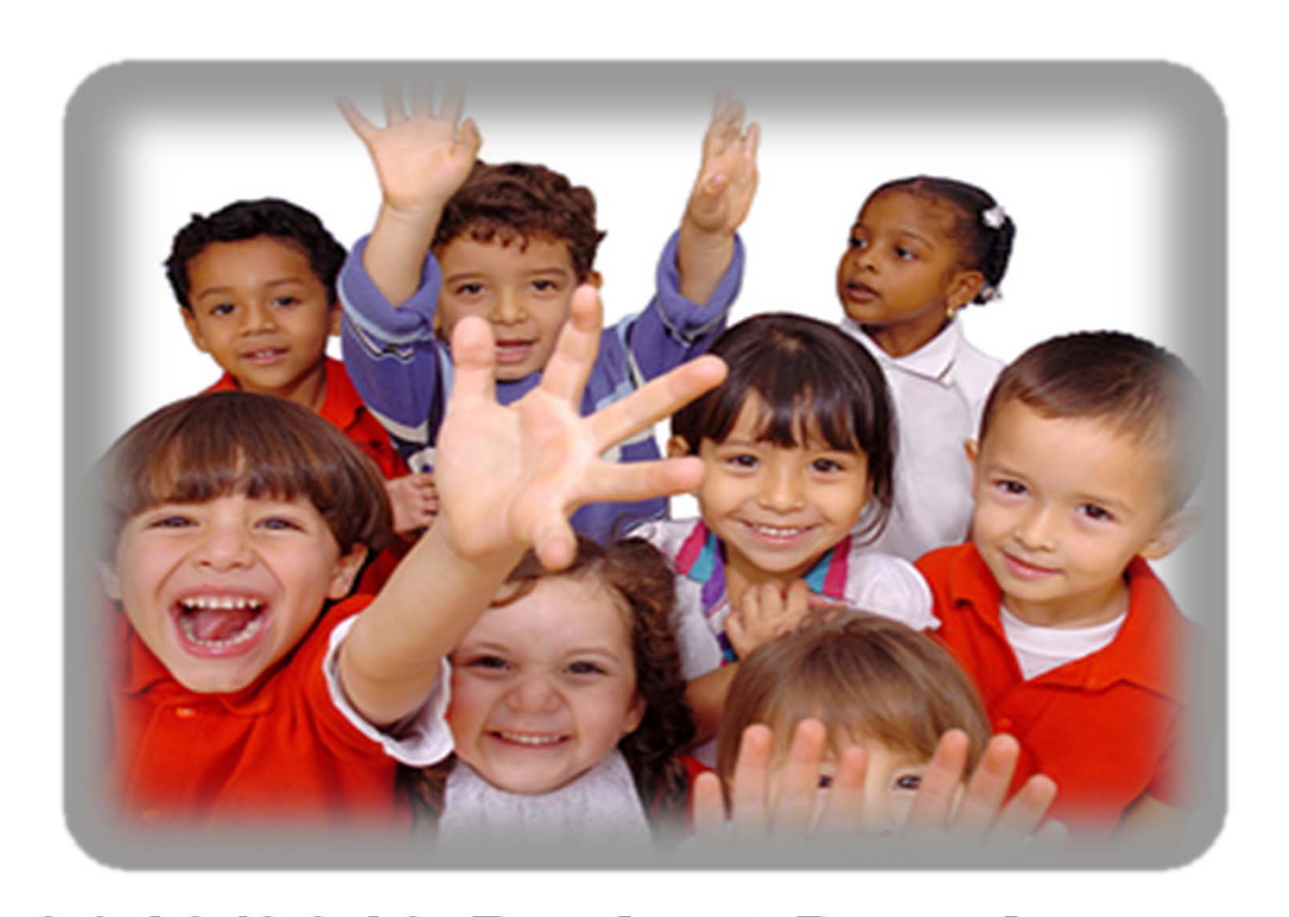
2018/2019 Budget Development April 25, 2018